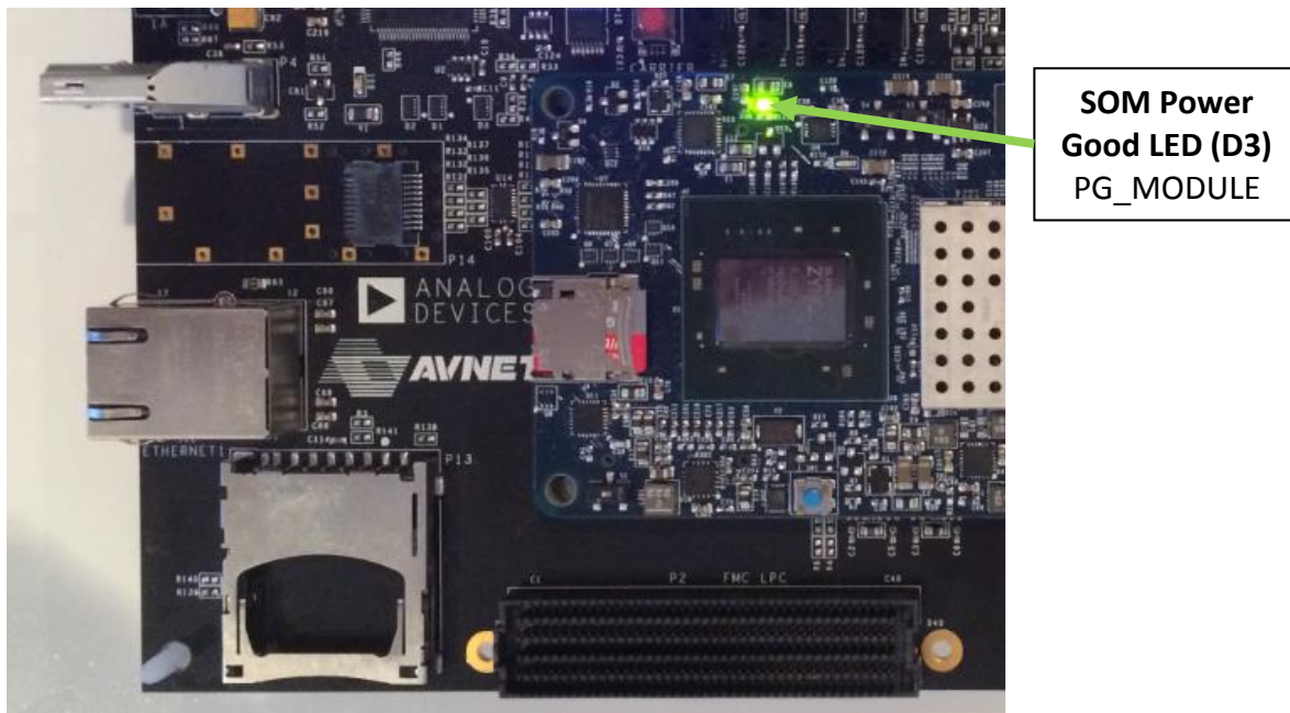
Figure 2 - Successful SOM Power Up with FMC Carrier

This section describes how to update the ADM1166 firmware on a PicoZed SDR 2x2 SOM connected to an Avnet carrier card. A Linux application running on the Zynq SoC reprograms the ADM1166 over I2C. This assumes your SOM powers up successfully (See Figure 1). If your SOM does not power up, refer to the section Power Up Fails .