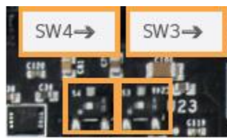
Boot Mode Select