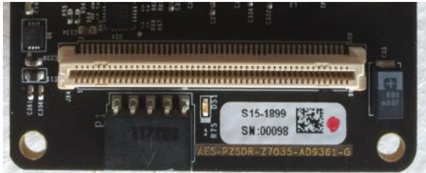
Figure 1 – Manufacturer's Label

If your module does not match either description, then this critical update should be applied to ensure reliable operation.